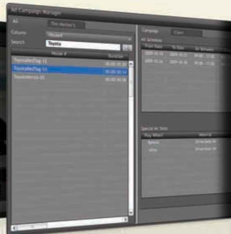
Ad Campaign Editor